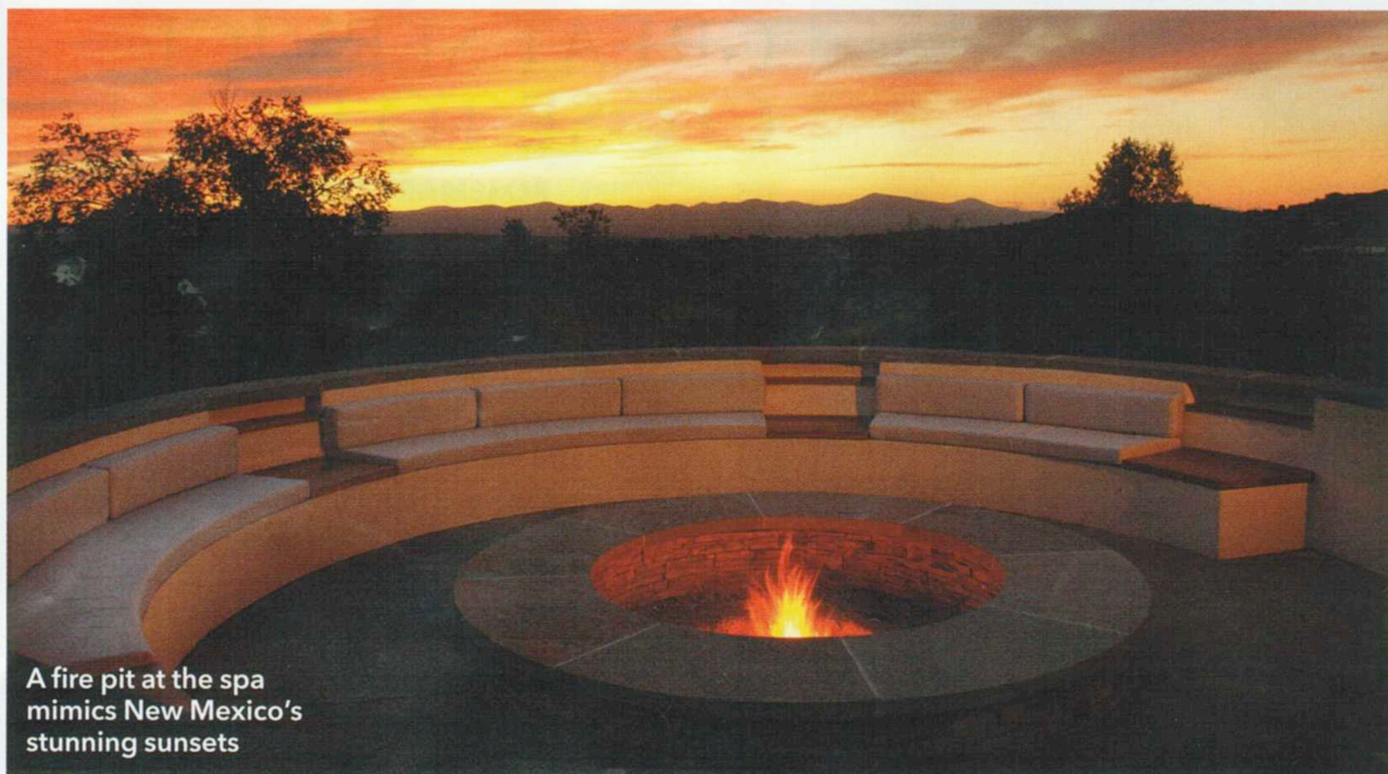
A fire pit at the spa mimics New Mexico's stunning sunsets

■ TV presenter Donna Air thinks Ushvani day spa is the best in London (020 7730 2888; www.ushvani.com ). 'It has an instantly relaxing vibe and treatments inspired by those traditional to East Asia,' she says. 'The uplifting smell of lemongrass hits you as you walk through the door, taking me back to a fabulous spa I once went to in the Andaman islands off the east coast of India.'