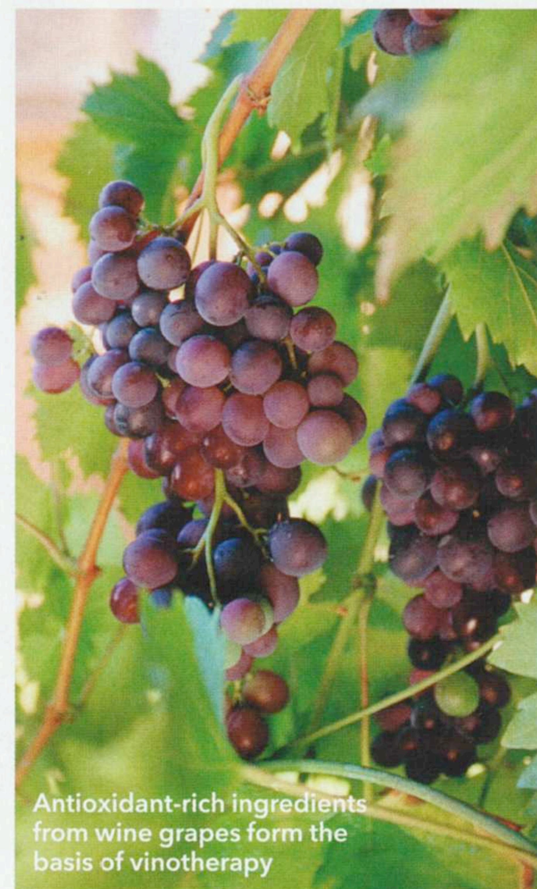
Antioxidant-rich ingredients from wine grapes form the basis of vinotherapy

If you prefer to try whipping up your own money-saving grape scrub, Susannah Marriot, author of 1001 Ways To Relax, suggests: 'Take 4-6tbsp grapeseed oil and add 1tbsp sea salt . Mix with 4-6 drops essential oil of rose , which is full of anti-ageing properties, and 2tbsp red wine . Put the contents into a jam jar and shake hard until the mixture emulsifies. Rub all over your skin to exfoliate and then hop into a nice warm bath and wash off. The smell of the red wine in the water will help to release feel-good endorphins, leaving you feeling happy and relaxed.'