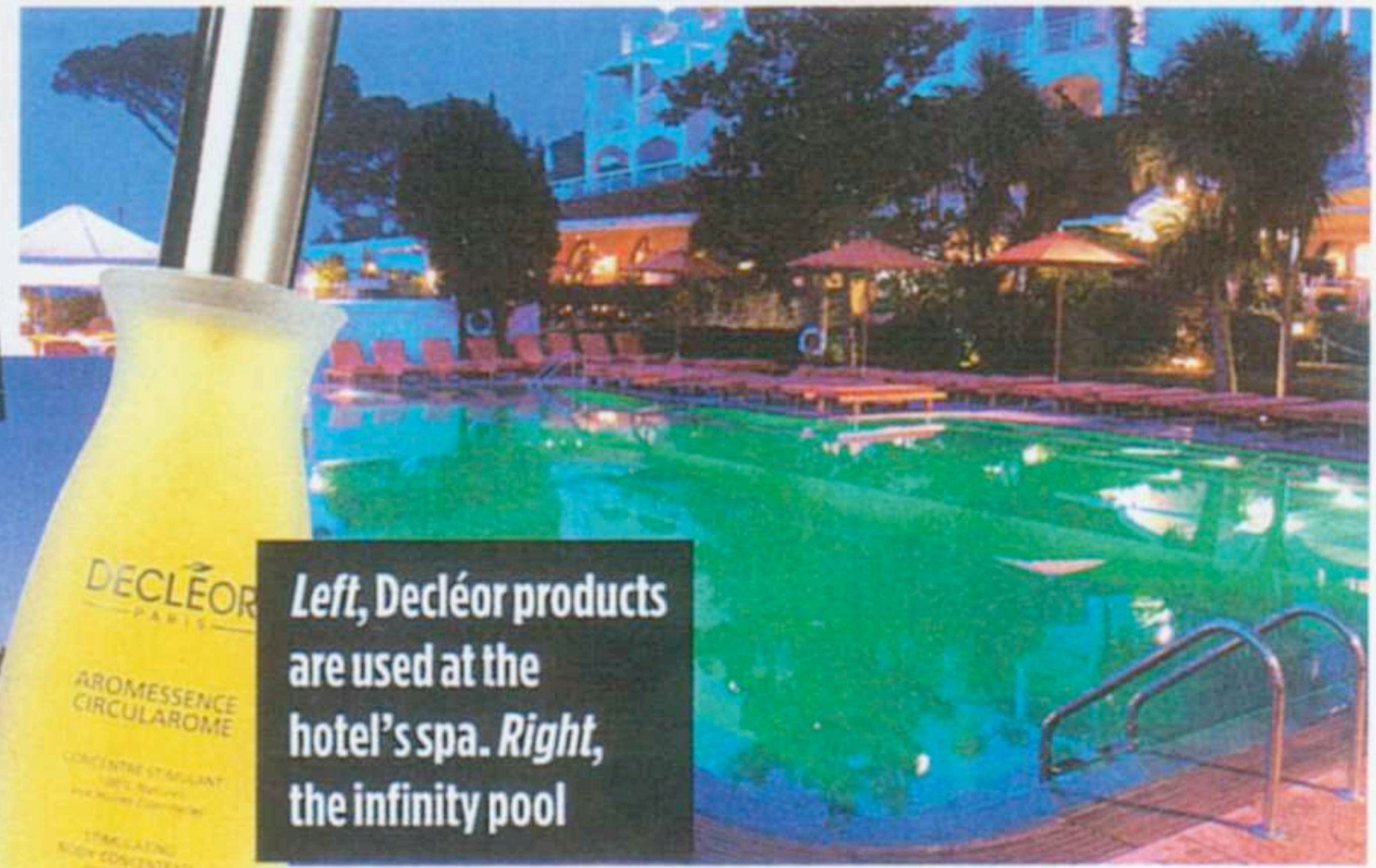
Left, Decléor products are used at the hotel's spa. Right, the infinity pool