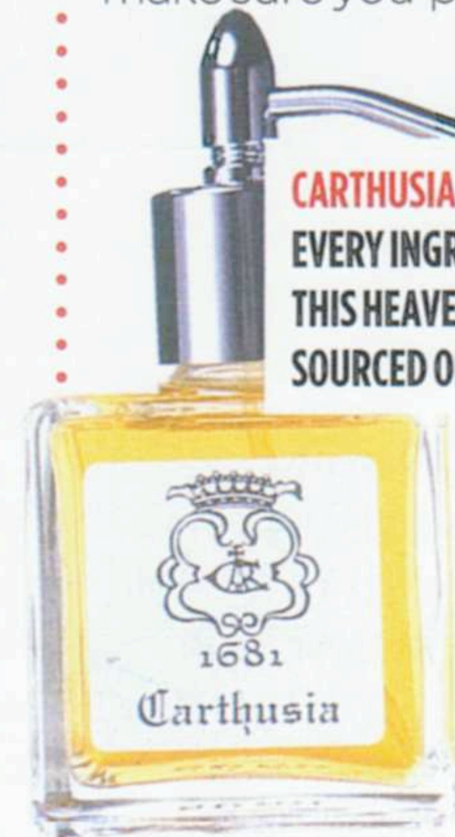
CARTHUSIA PERFUME EVERY INGREDIENT OF THIS HEAVENLY SCENT IS SOURCED ON THE ISLAND

Vogue's fashion team always leave room in their suitcases for goodies they can buy abroad. Before leaving Capri, make sure you pick up the following: