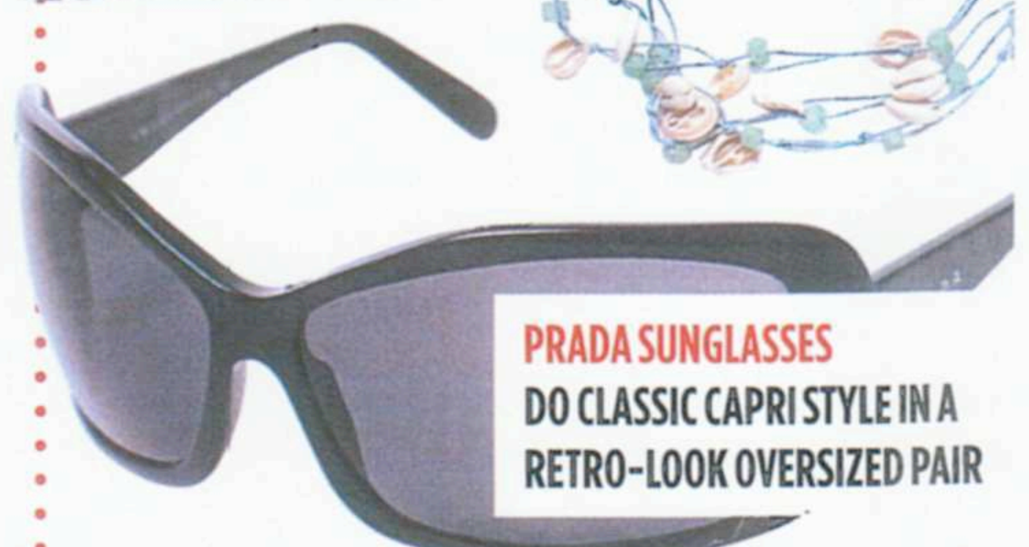
PRADA SUNGLASSES DO CLASSIC CAPRI STYLE IN A RETRO-LOOK OVERSIZED PAIR

LIMONCELLO ALWAYS SERVED VERY COLD, CAPRI'S LEMON LIQUEUR IS DANGEROUSLY GOOD