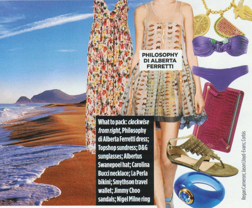
Travel to sunny places like "Play It's hot" and "Play Just to see of Page

● WHALE WATCHING As its name suggests, Punta Ballena is one of the best places to view the migration of blue and grey whales, as well as bottlenose dolphins ● TODOS SANTOS A coastal town founded as a mission in 1724, with colonial architecture, cobblestone streets and the Hotel California, said to be the one made famous by The Eagles. Hotelsforallifornia.com ● COSTA AZUL A great surf spot. Book homes at CostaAzulSurf.com