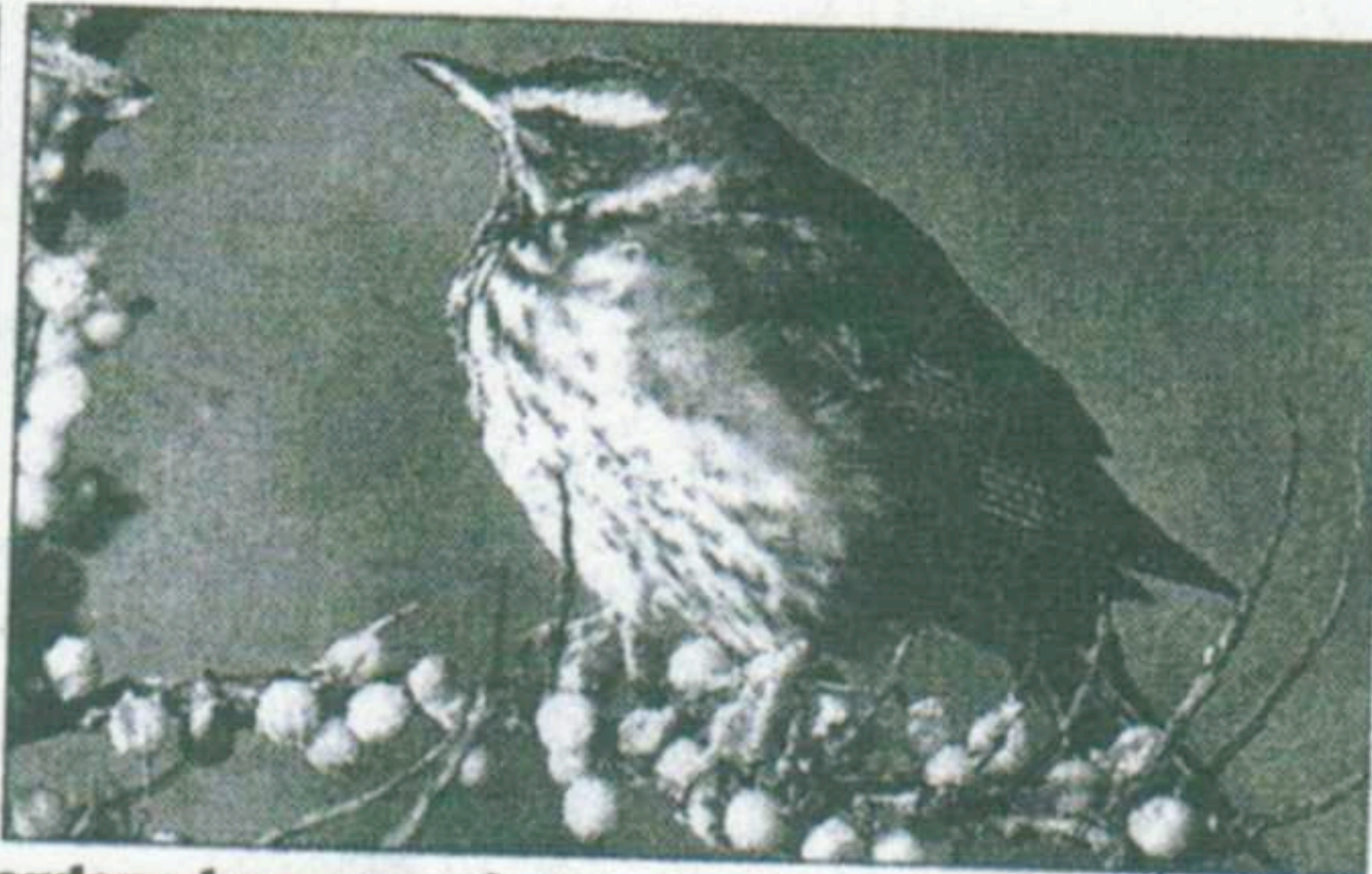
Fieldfare, left, and redwing might not visit gardens because of abundant berries in hedges