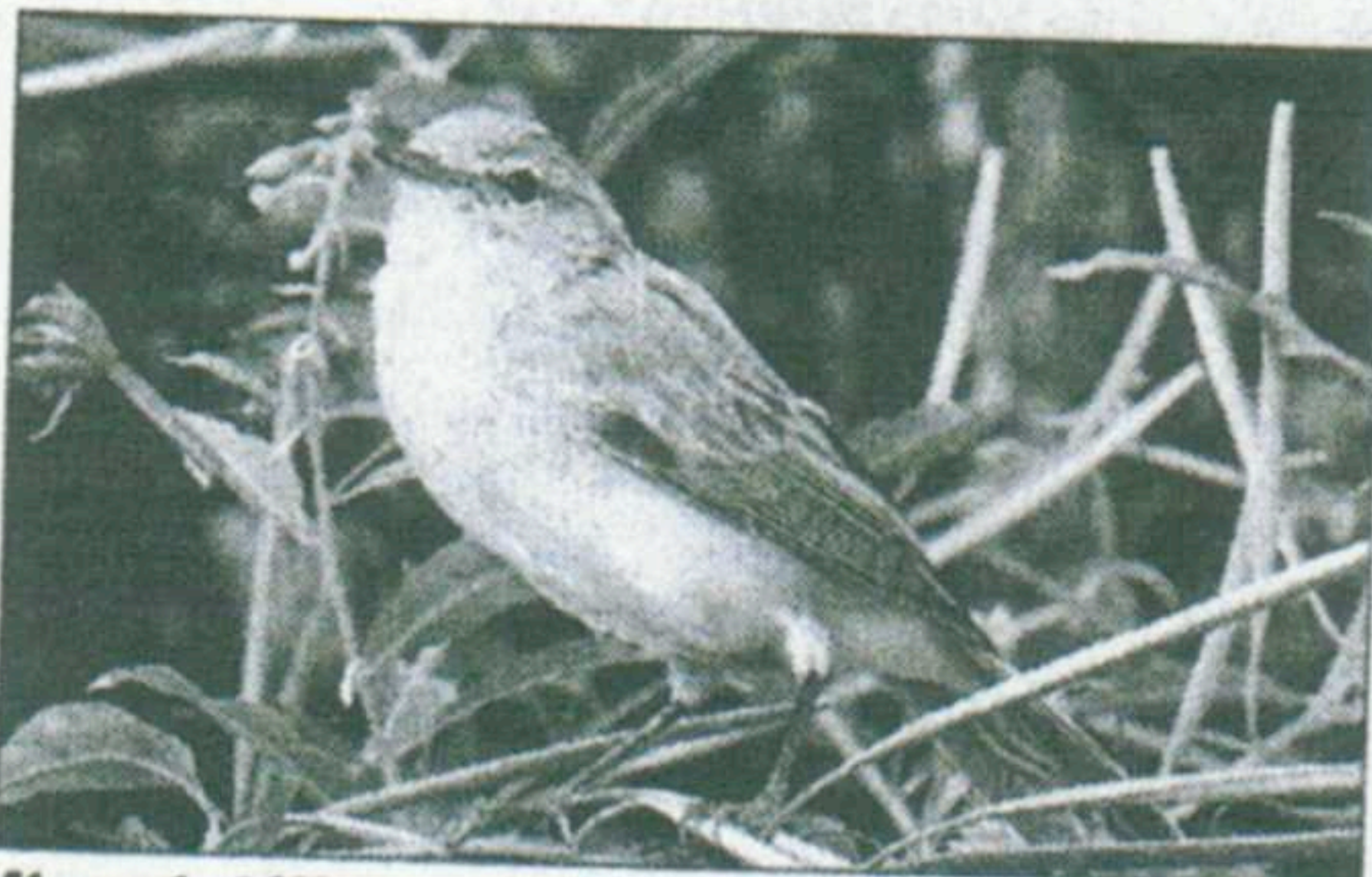
Britain's mild winter could mean that blackcap, left, and chiffchaff feel no need to migrate