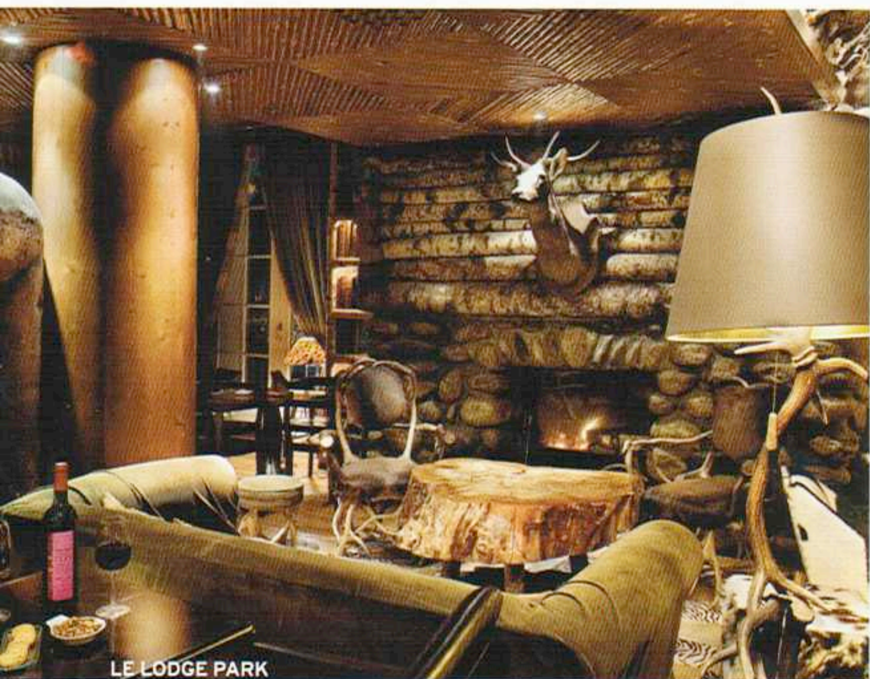
LE LODGE PARK