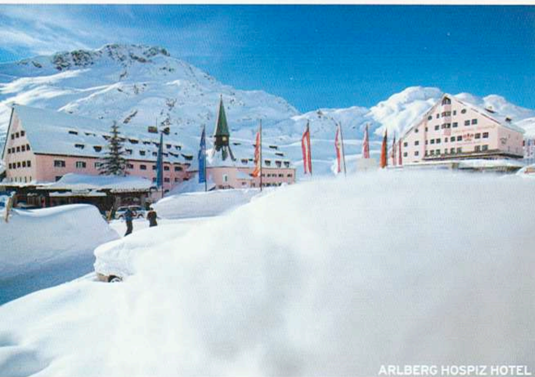
ARLBERG HOSPIZ HOTEL