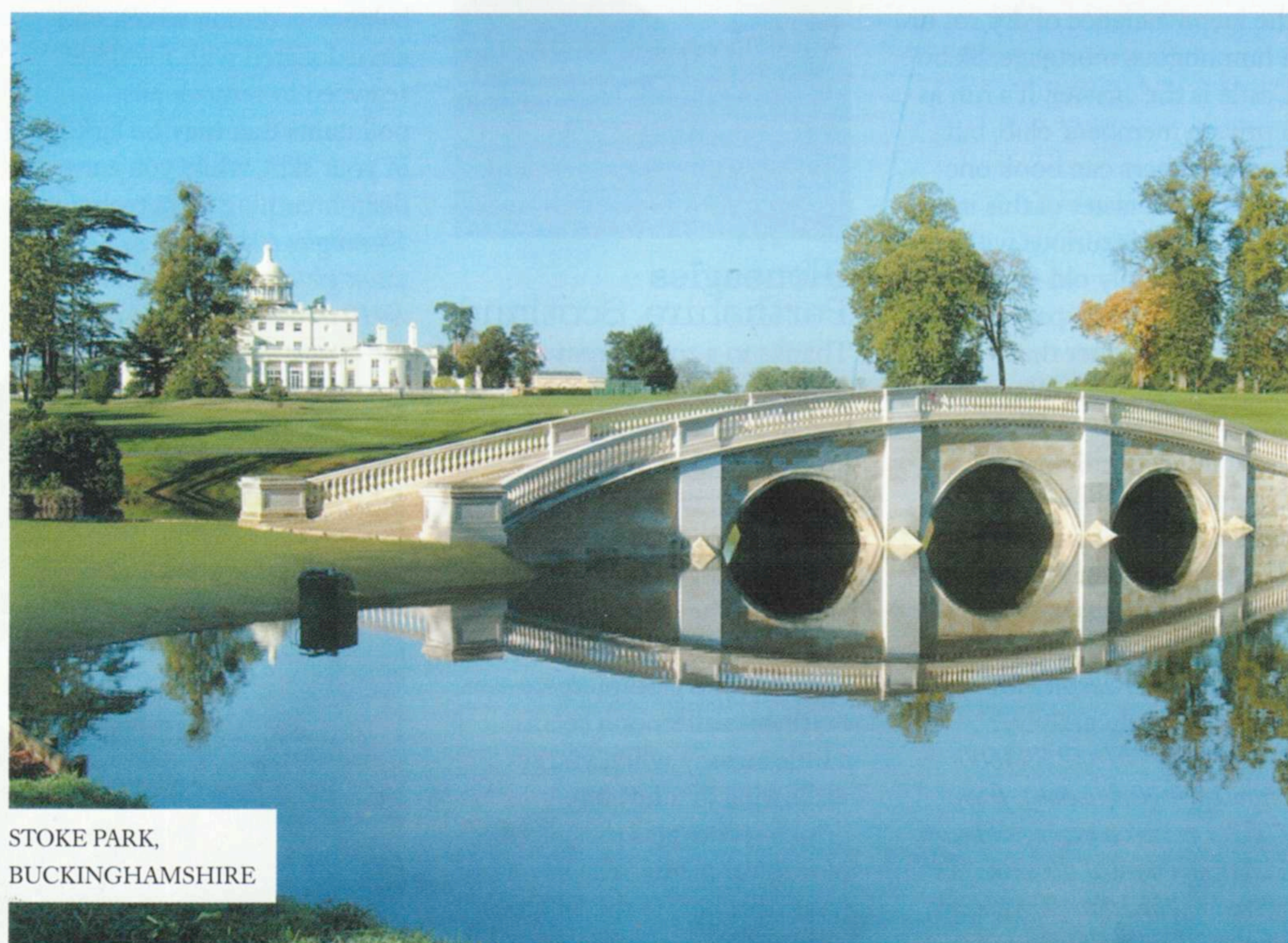
STOKE PARK, BUCKINGHAMSHIRE

Spa SPC Stoke Park Club, Buckinghamshire Stoke Park Club's Spa SPC is very much a luxury retreat in