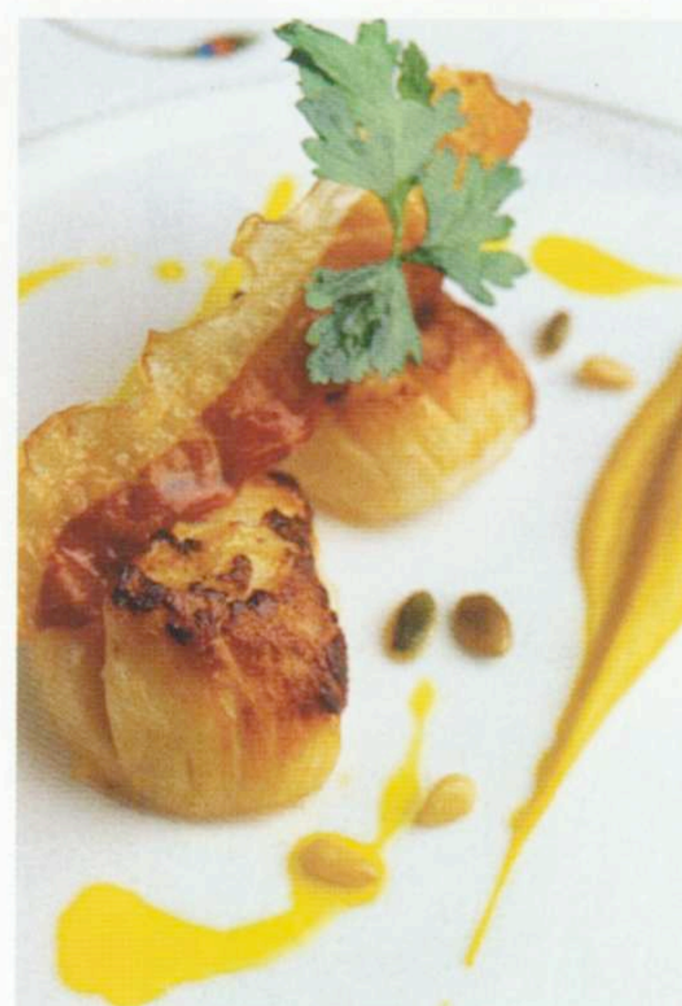
Above Hand-dived Shetland scallops at Whatley Manor