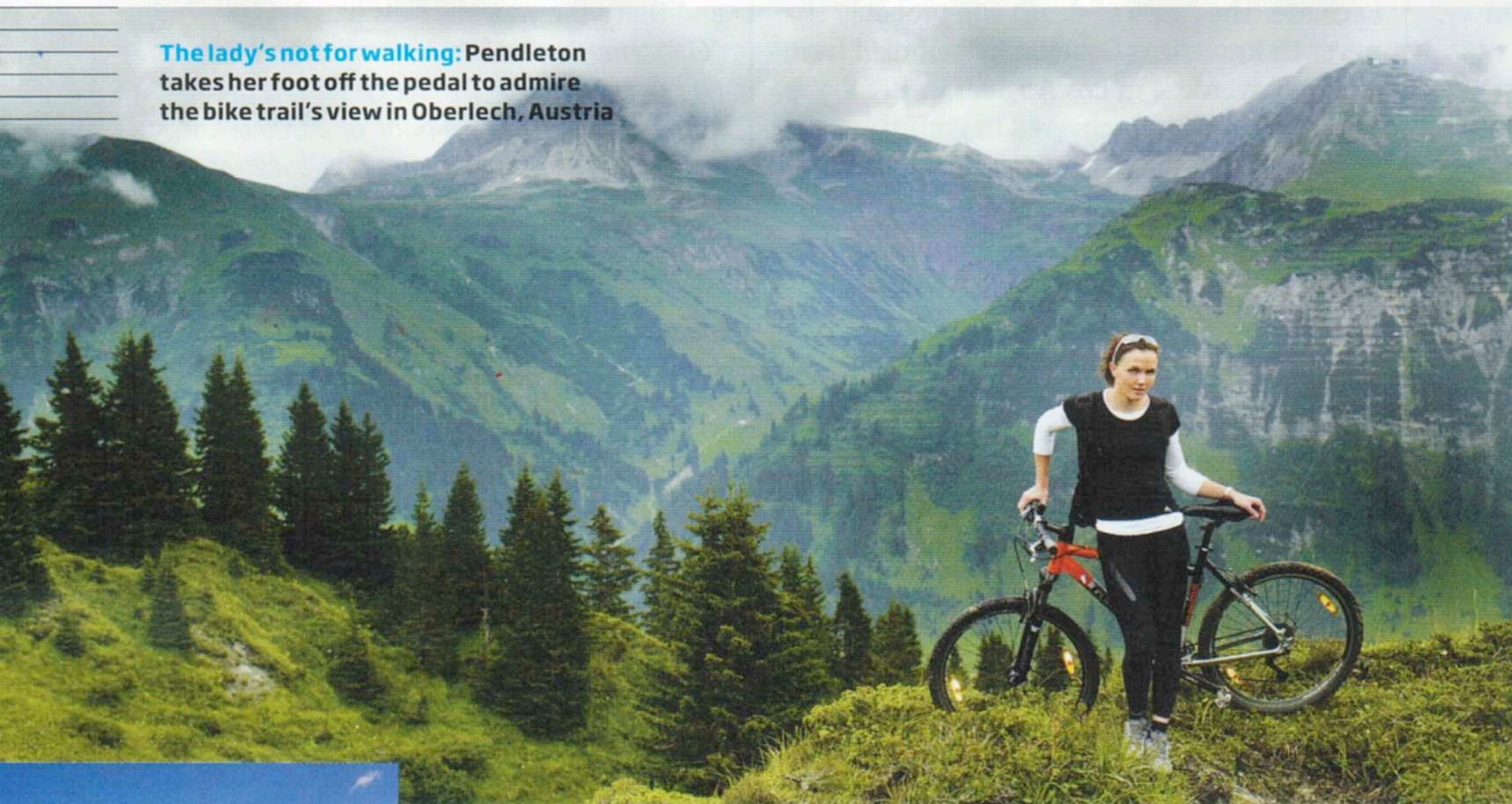
The lady's not for walking: Pendleton takes her foot off the pedal to admire the bike trail's view in Oberlech, Austria

There's nothing like breathing in crisp, mountain air – so why wait until the snow has settled to make the most of it? The spoils of the Austrian Alps are there to be enjoyed all year round, discovers Olympic gold medallist Victoria Pendleton