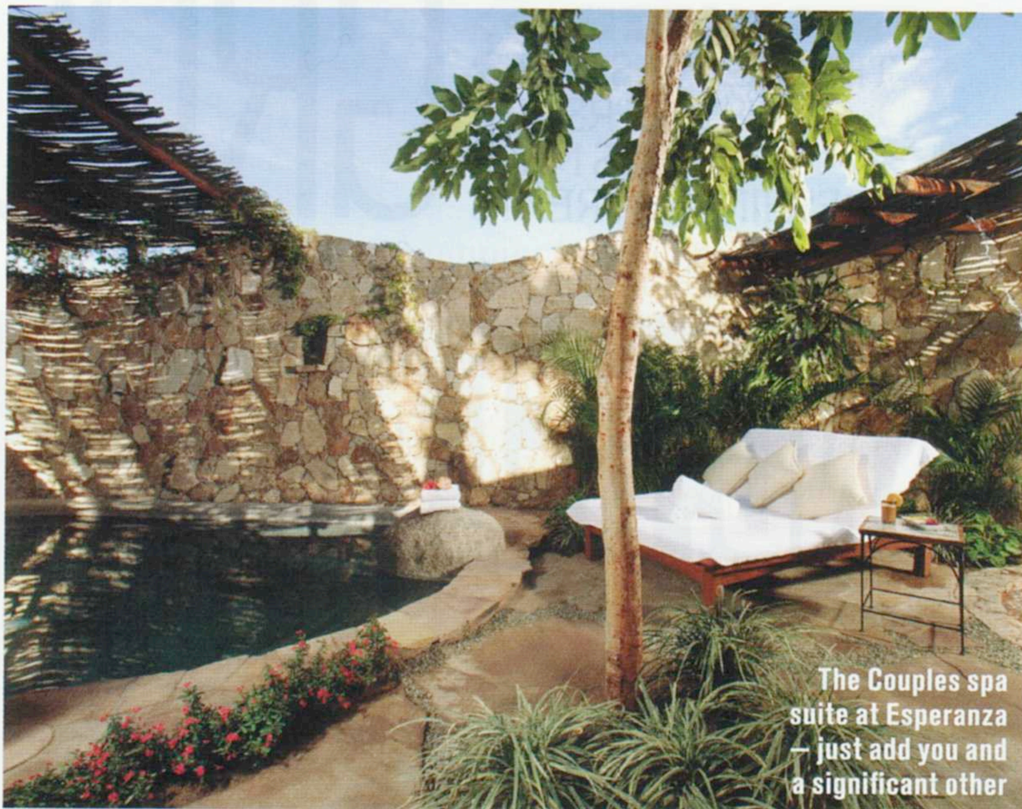
The Couples spa suite at Esperanza – just add you and a significant other