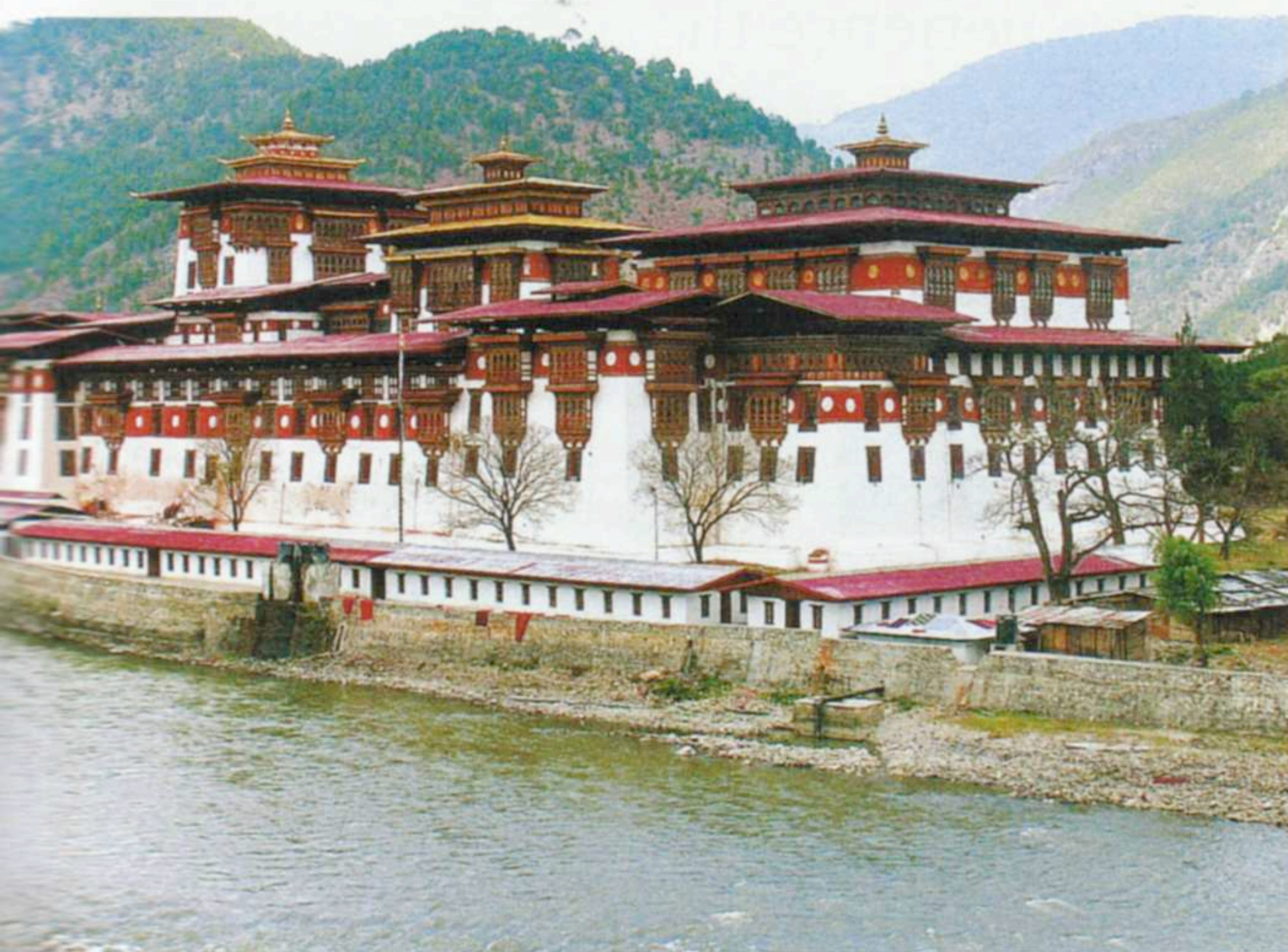
Above: Punakha Monastery in Bhutan, one of the destinations offered by Remote Lands. Below: action from the horse race festival in Yushu, Qinghai Province.

For a different perspective on INDIA , Cazenove + Loyd (www.cazloyd.com) is eschewing big branded hotels in favour of