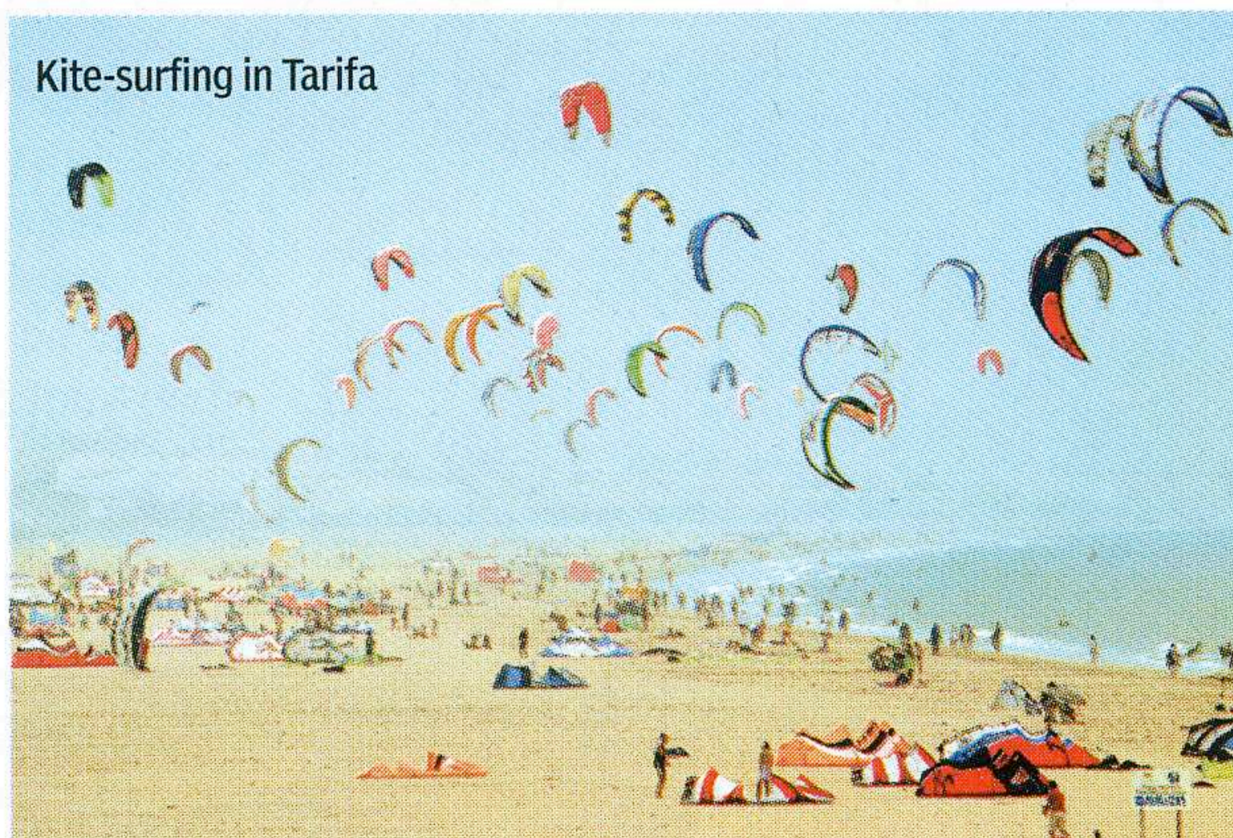
Kite-surfing in Tarifa

Where to stay The Kahala Hotel & Resort has a lagoon with six bottlenose Atlantic dolphins ( www.kahalaresort.com ). Or splash out on the five-star Halekulani Hotel ( www.halekulani.com ).