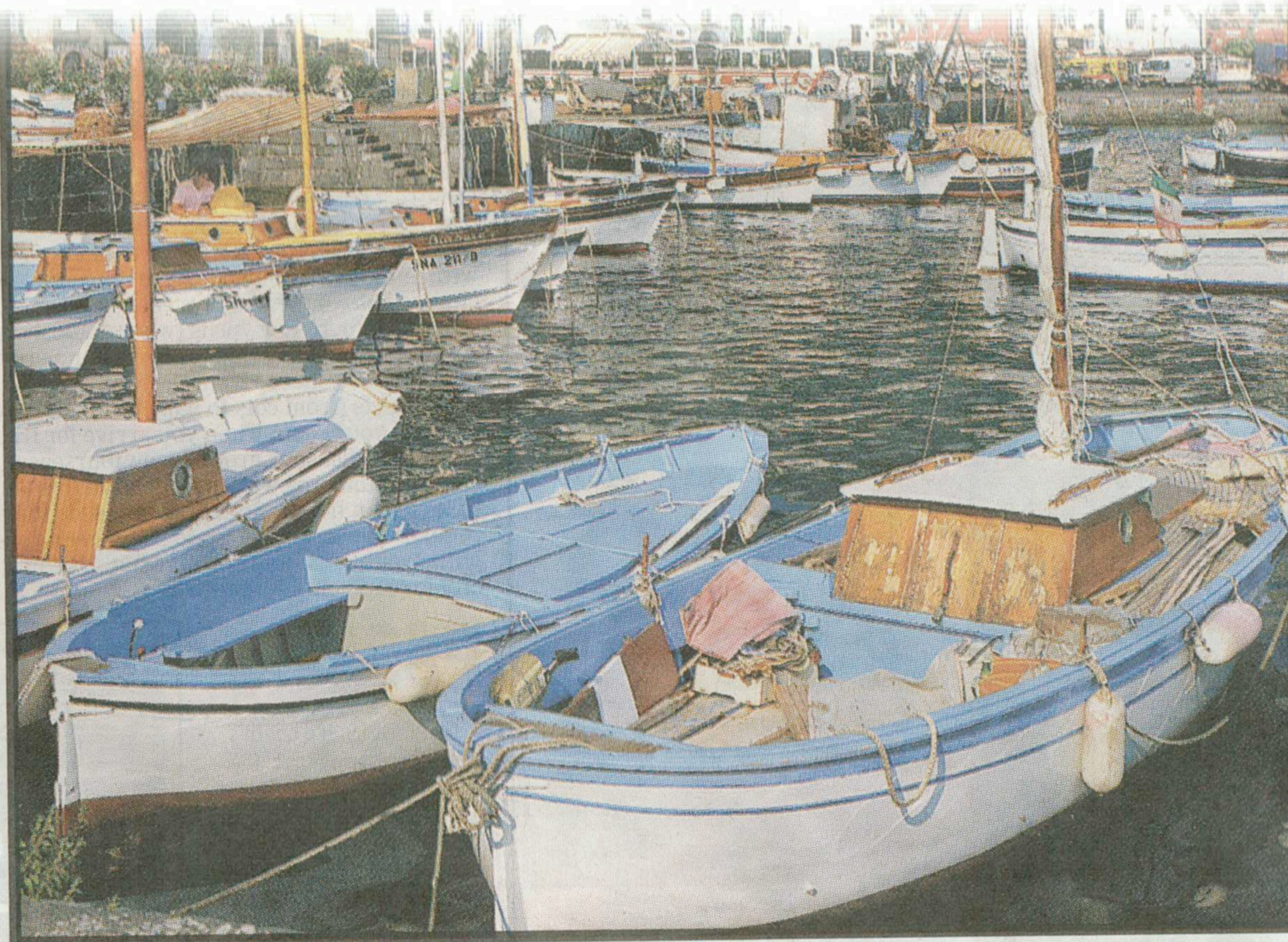
On the waterfront: the picturesque side of the harbour, Marina Grande, is surrounded by the atmospheric old village

The Draw: quieter and more rustic than Capri Town with few nightclubs. The town has fine views and some lovely buildings, including the church of San Michele. Walk the