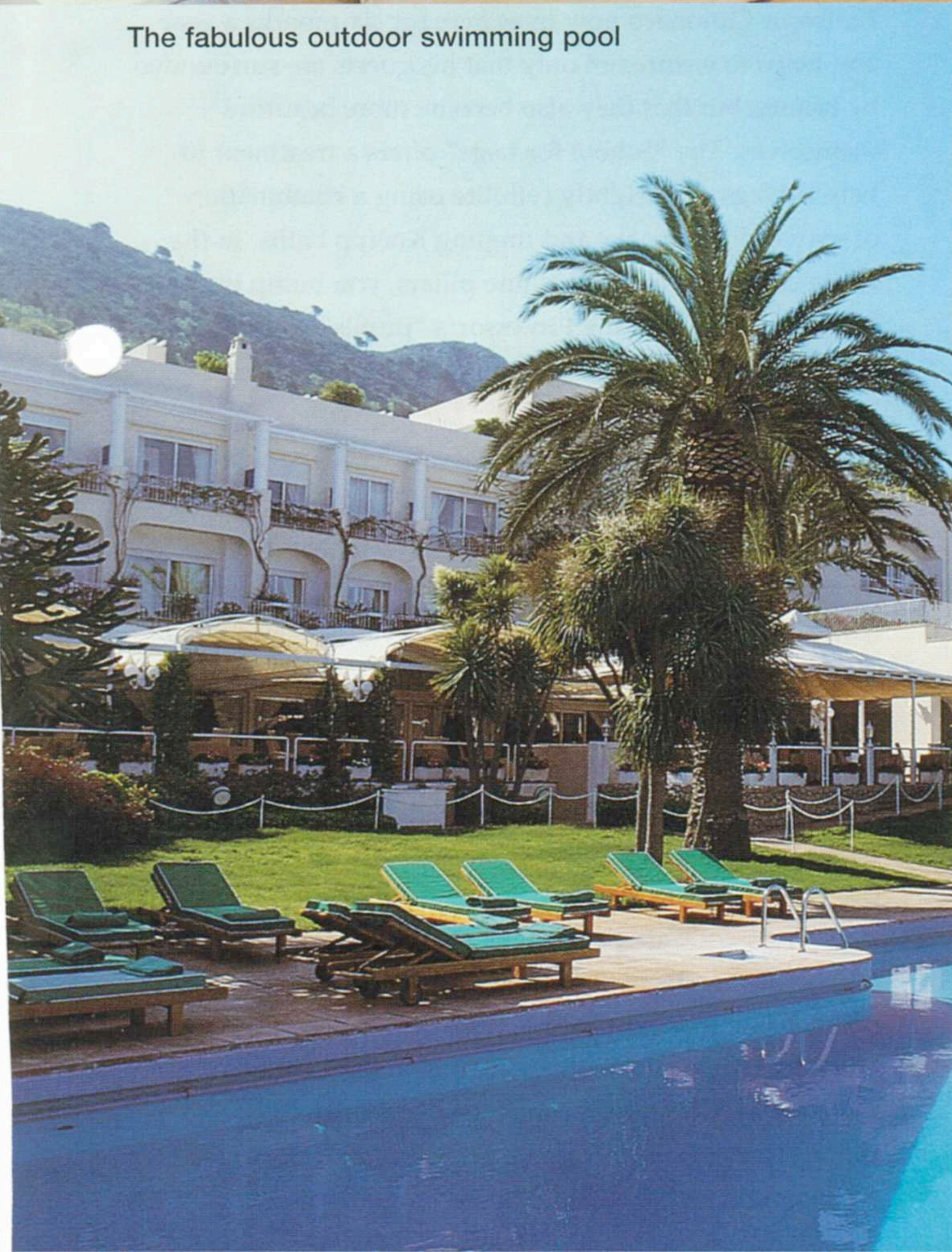
The fabulous outdoor swimming pool