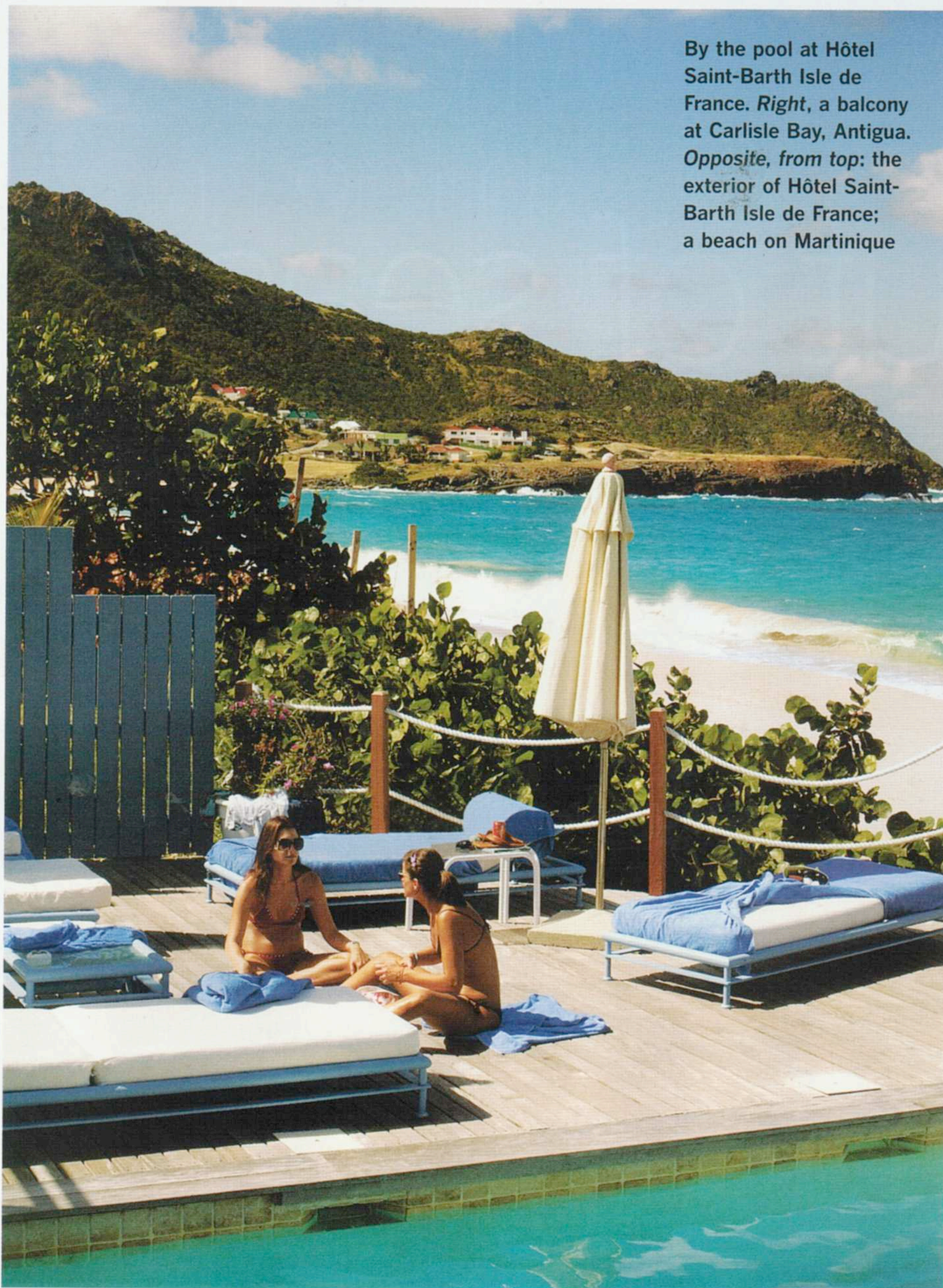
By the pool at Hôtel Saint-Barth Isle de France. Right , a balcony at Carlisle Bay, Antigua. Opposite, from top : the exterior of Hôtel Saint-Barth Isle de France; a beach on Martinique