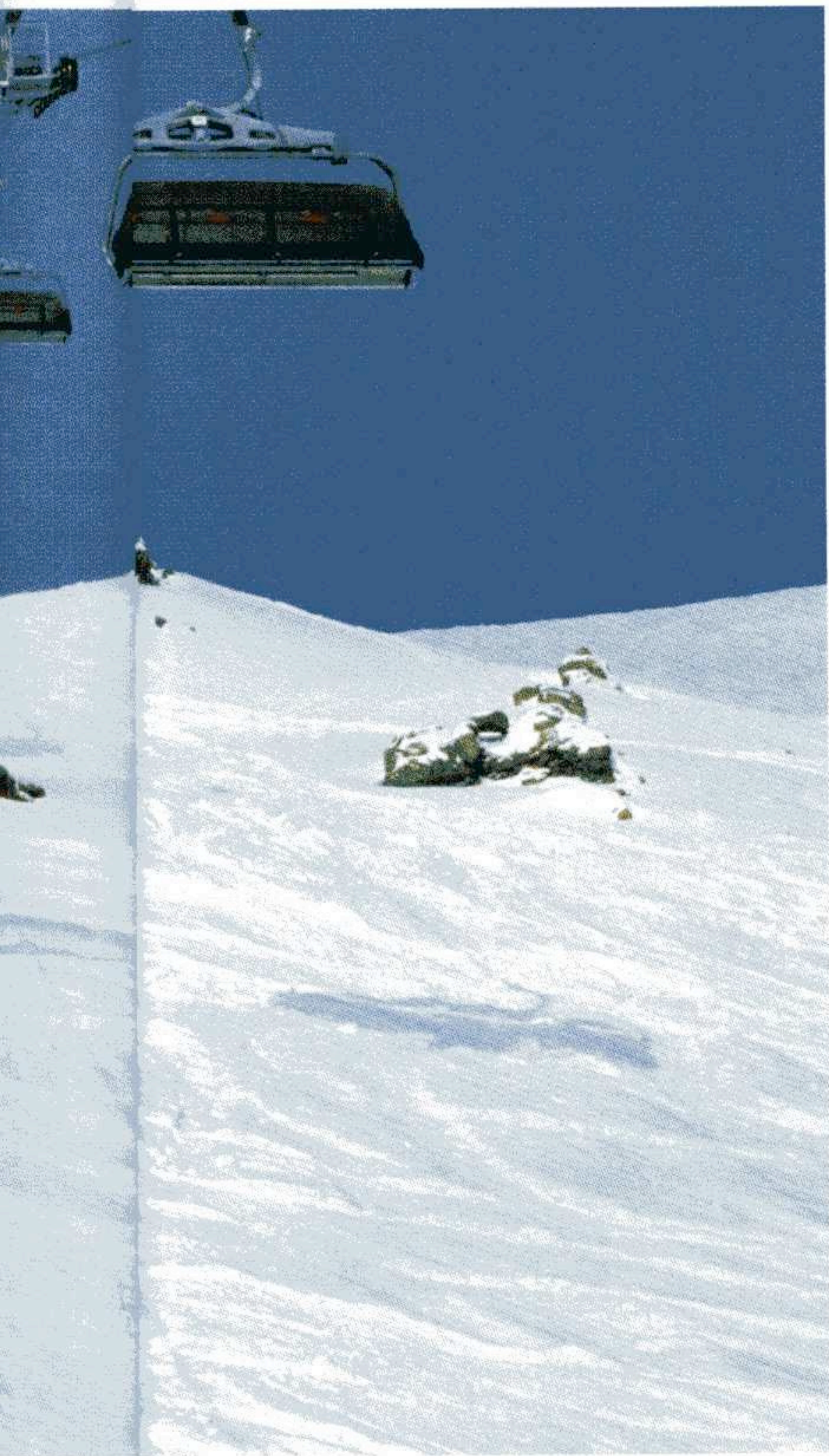
LEFT: Lech in the Arlberg region is one of the top ski destinations in Austria. RIGHT: Saas-Fee offers over 320 km of hiking trails. BELOW: the picturesque surroundings of the Arlberg Hospiz hotel