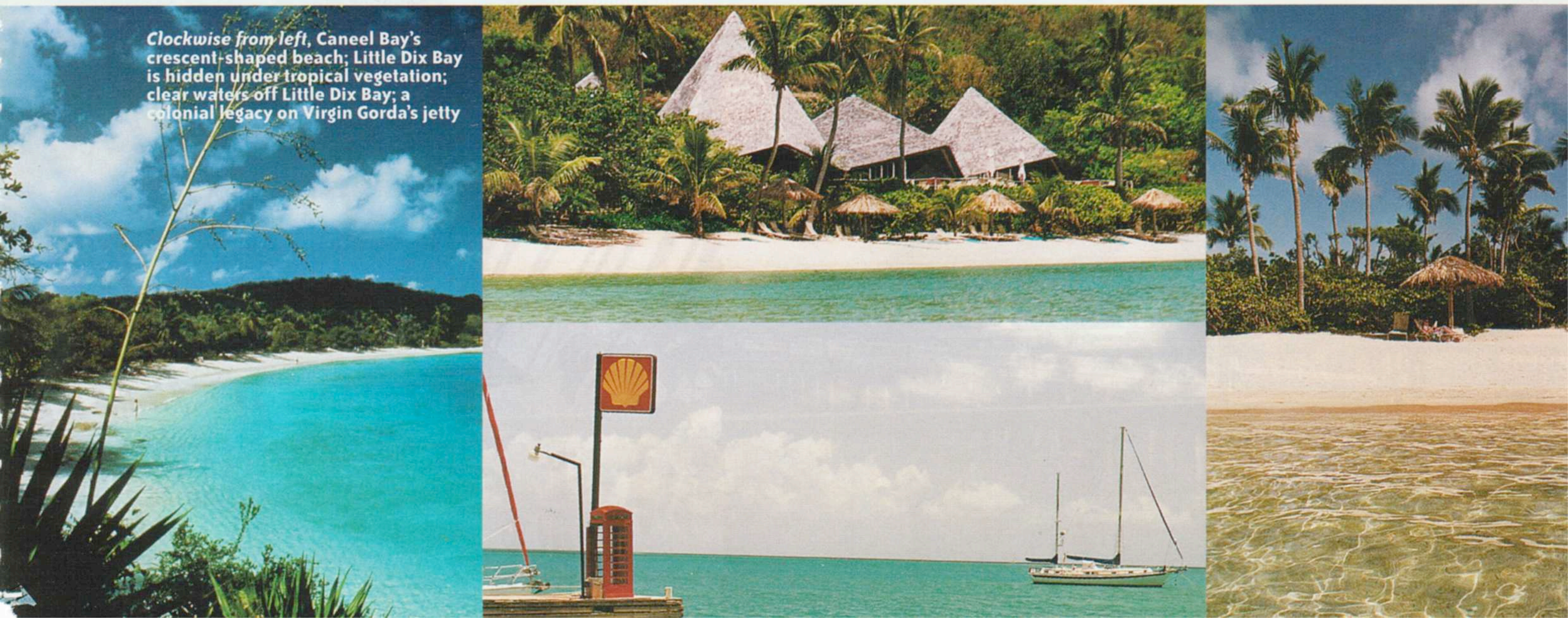
Clockwise from left, Caneel Bay's crescent-shaped beach; Little Dix Bay is hidden under tropical vegetation; clear waters off Little Dix Bay; a colonial legacy on Virgin Gorda's jetty

INFO Classic Connection (01244 355538) offers 7 nights (3 at Caneel Bay and 4 at Little Dix Bay) from £2,129 per person including flights with American Airlines (0845 778 9789) to St Thomas, returning via Miami. A Caneel Bay representative will transfer you by boat. Both hotels are Rosewood Hotels & Resorts (020 7333 7013) ■ CURRENCY: US dollar ■ WHAT TO BUY: rum ■ WHAT TO READ: The Caribbean & the Bahamas (Cadoğan, £14.99)